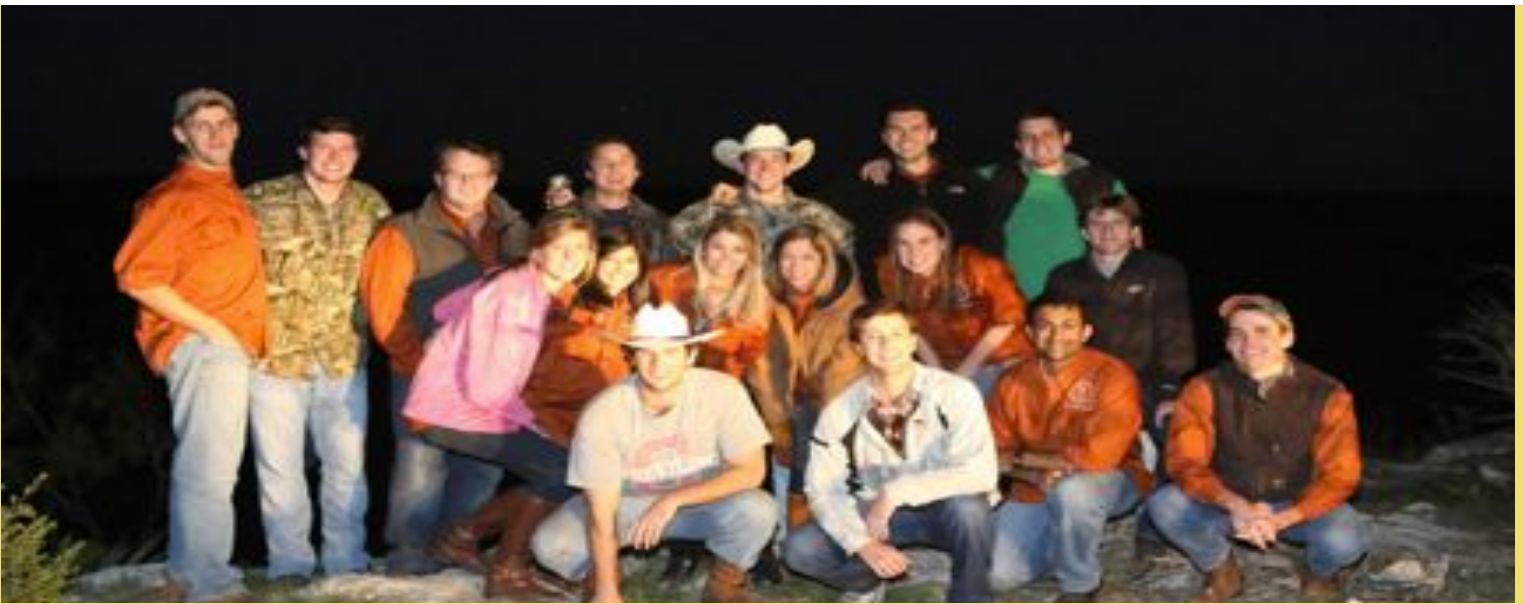
TJOGEL Board Retreat, November 2013